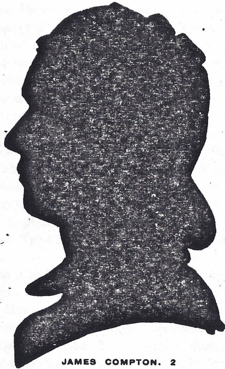
JAMES COMPTON. 2